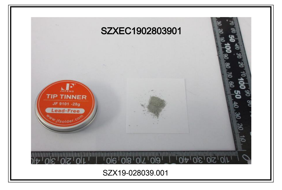
SGS authenticate the photo on original report only