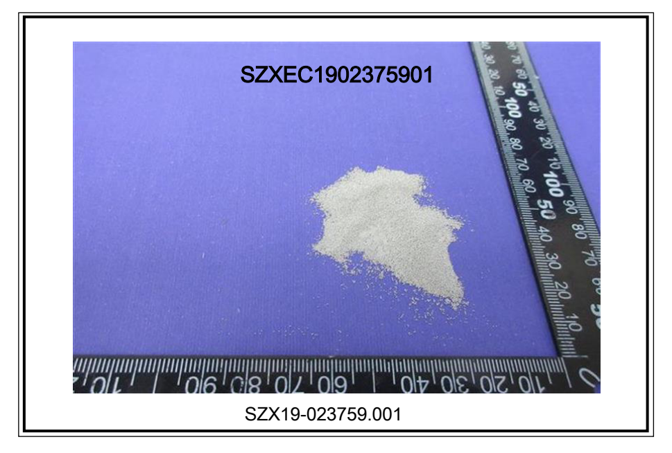
SGS authenticate the photo on original report only